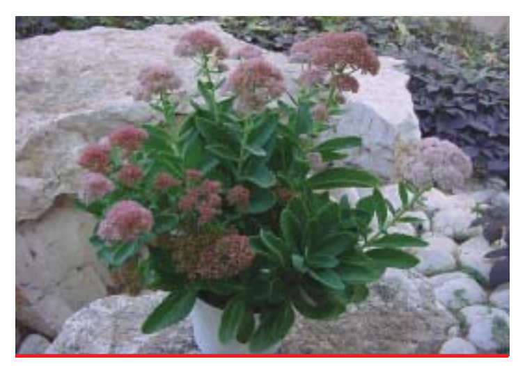
Sedum telephium 'Autumn Joy'

Recently, the possibility of bare-root production of herbaceous perennials was proven through scientific experiments in collaboration with leading commercial producers. The new concept of bare-root production in Israel illustrates the possibilities for cultivating ornamental plants with special physiological traits. The potential for bare-root production in Israel is based on the unique climatic conditions of this country: high light intensity, warm winter temperatures and the short photoperiod during plant growth