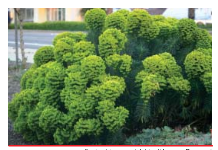
Euphorbia amygdaloides 'Humpty Dumpty'