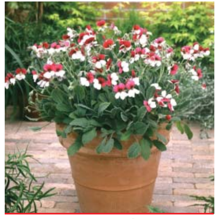
Pelargonium violareum Courtesy of "Hishtil", 2006

method allows us to produce and transport non-dormant plants, which will sprout immediately after re-planting.